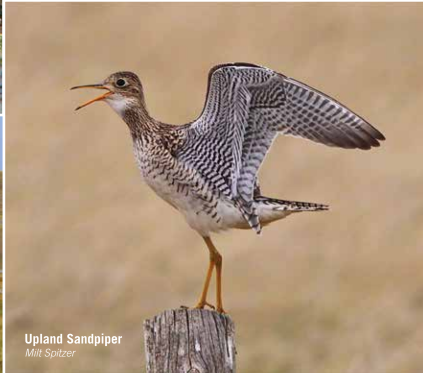
Upland Sandpiper Milt Spitzer