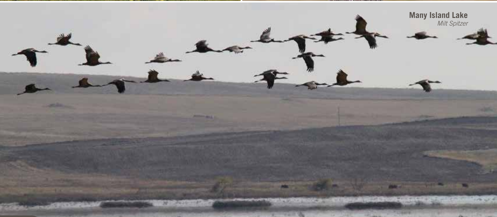
Many Island Lake Milt Spitzer