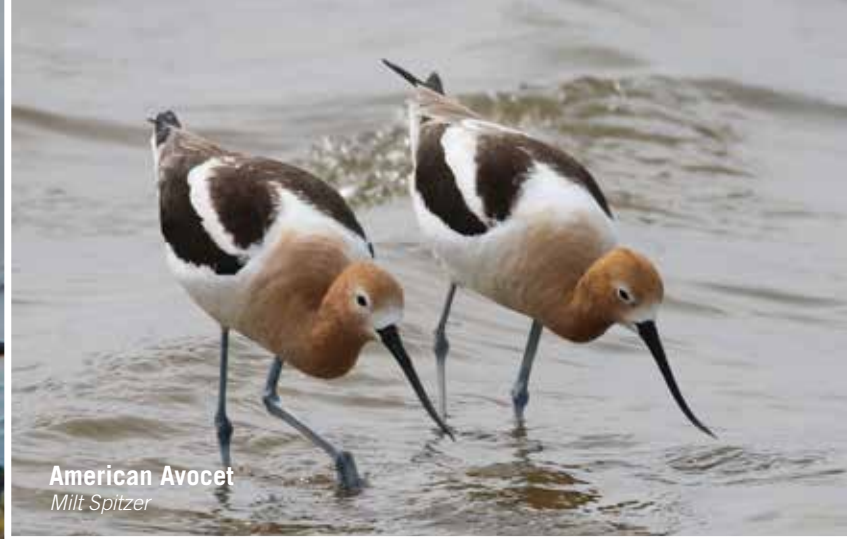
American Avocet