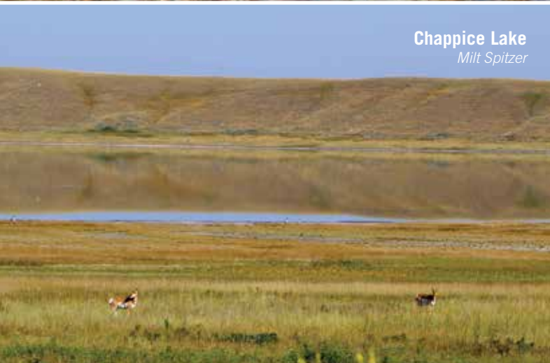
Chappice Lake Milt Spitzer